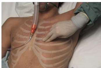
Figure 1. Locating Landmarks.

Position the patient in either a supine or a semirecumbent position. Maximally abduct the ipsilateral arm or place it behind the patient's head. The area for insertion is approximated by the fourth to fifth intercostal space in the anterior axillary line at the horizontal level of the nipple. This area corresponds to the anterior border of the latissimus dorsi, the lateral border of the pectoralis major muscle, the apex just below the axilla, and a line above the horizontal level of the nipple—often referred to as the “triangle of safety.” 2 You can isolate this area by palpating the ipsilateral clavicle, then working downward along the ribcage, counting down the rib spaces. Once the fourth to fifth intercostal space is felt, move your hand laterally toward the anterior axillary line (Fig. 1). This is the area for incision; the actual insertion site should be one intercostal space above the chest-tube incision site. Mark the spot for incision on the skin with a pen or the back of a needle.